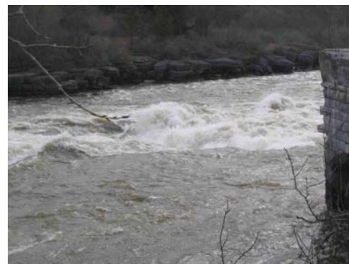
Nightmare Fuel , Merry's Hole, Black River, 11,000cfs.