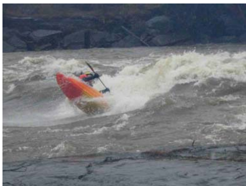
Paul Twist, Inner City Wave , Black River

FLOW has again secured pool time at MCC and Wheatland-Chili HS. The sessions at W-C will start on Monday February 28 and run from 7– 9 pm. The sessions at MCC will be on Friday night from 8:30– 10pm and will run from 2/25 until 4/15. The prices for members will be the same as last year, $5 per session, $35 for an individual season pass or $45 for a family season pass. The price for non-members is $15 ($5 for pool practice and $10 for the ACA's one day insurance coverage. That means if you go to 3.5 pool practices you've paid for a FLOW membership.