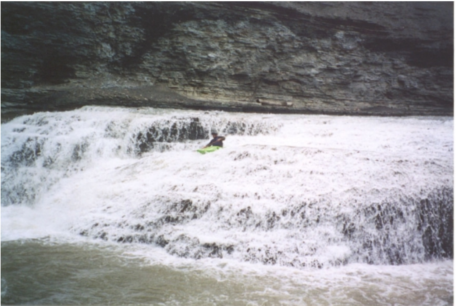
Don Cochran running the falls on South Branch of the Cattaraugus

From 100 yards up stream we could see water spitting up from the horizon of THE FALLS. The stair-like portage on river right was swallowed up to the canyon wall. There was a micro eddy across the way on the river left, big enough for one boat and