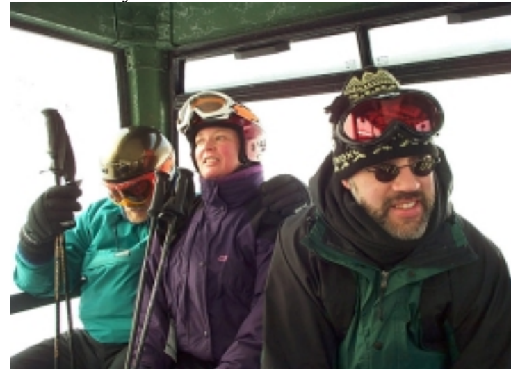
Inside The Shuttle Vehicle