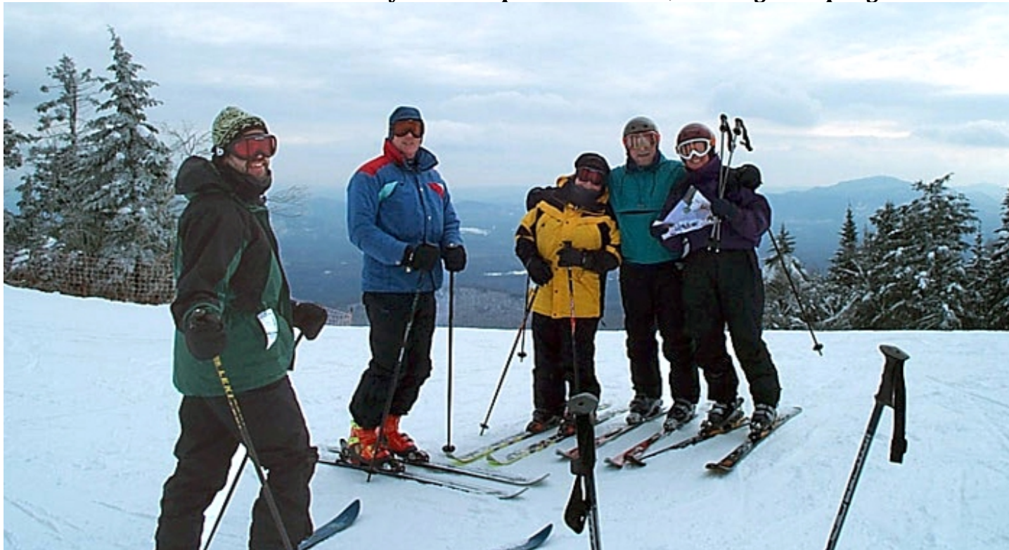
Notable Horizon Line Lurks Behind The Unwary.

What do FLOW paddlers do before the water gets to the river? The best they can, with it. A few FLOW members were recently found atop Gore mountain, scouting this spring's run-off.