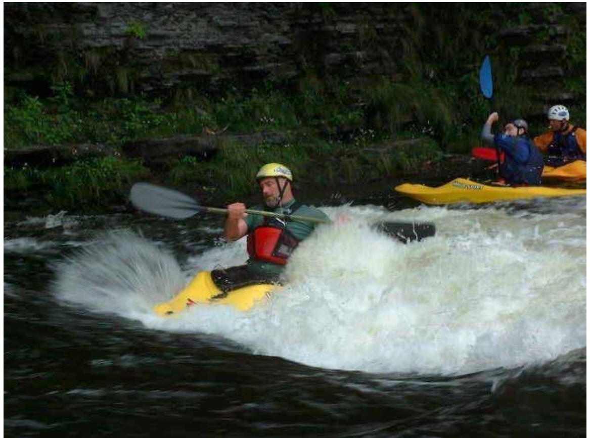
Unidentified Paddler on the Salmon River.