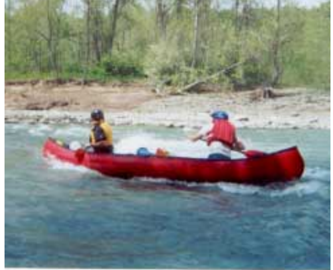
Genesee River, Letchworth