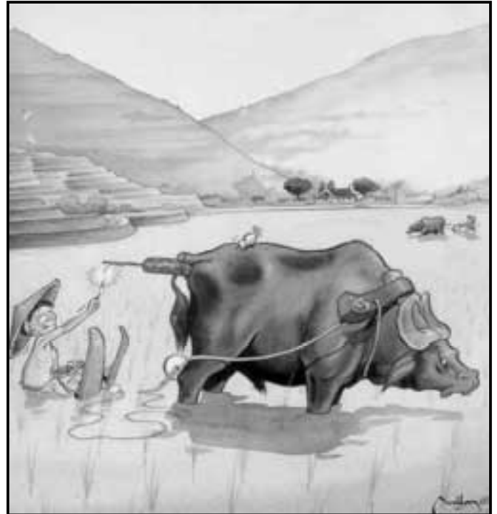
What We Do Without A Boat And River

FLOW Paddlers Club 43 Whelehan Drive Rochester, NY 14616