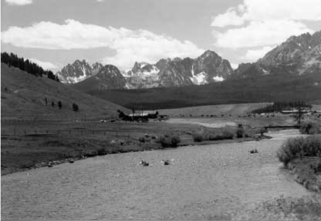
Salmon River, Sawtooth Mountains

Article and Photographs By George Mermagen