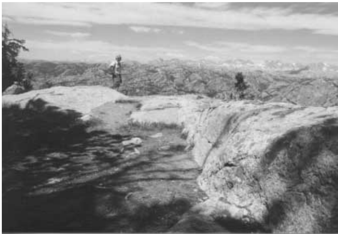
Wind River Range

were drawn to a float trip on the Snake. I know as a kayaker I should have shunned that big rubber boat but it's mystical power caused us to go with the flow. We were rewarded with an aerial battle between an osprey and a bald eagle. Three wild bison grazed on the bank. Beavers peered out of the tall grass as we glided past. Mule deer slept in the shade of aspens too late to detect our silent approach. Shadowy glimpses of elk on high banks and moose in the shrubby willows piqued our curiosity. Brief but frequent views of the