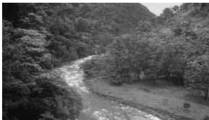
An Unidentified river in Costa Rica