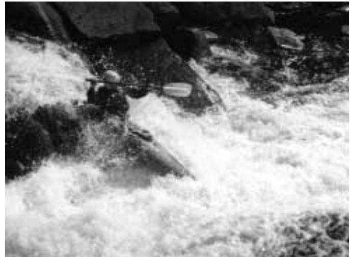
Tom (Trip Kit) Congdon braving one of the many drops on the Beaver.