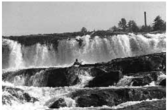
Ben 'Pretty-Boy' Bramlage running Agers Falls - Bottom Moose - October '98

Sunday found it easy to pack up dry tents. While heading back, a tour of Slim Bay revealed a beaver dam holding back the waters of Mud Bay. A few more neat islands and bays latter returned us the boat ramp area. Hot showers at the campground felt great before driving south to a fulfilling lunch spot. Charleston Lake was another great FLOW Paddlers' sea kayaking weekend. With so much to see and do here, we concluded that- we will be back, for more adventures next year. Stay tuned. - Harry Weidman -